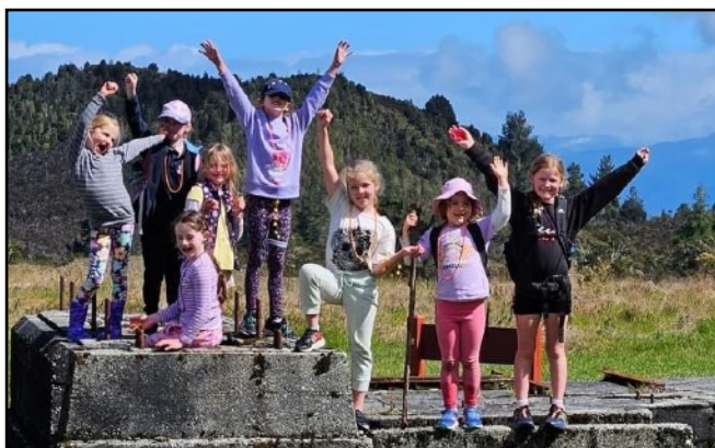
Who said that learning wasn't enjoyable

On a lighter note: we were pleased to report that recently the Greymouth Brownies spent an excellent 2 nights at our Lodge exploring Waiuta and in the process learning of their values, skills, and beliefs.