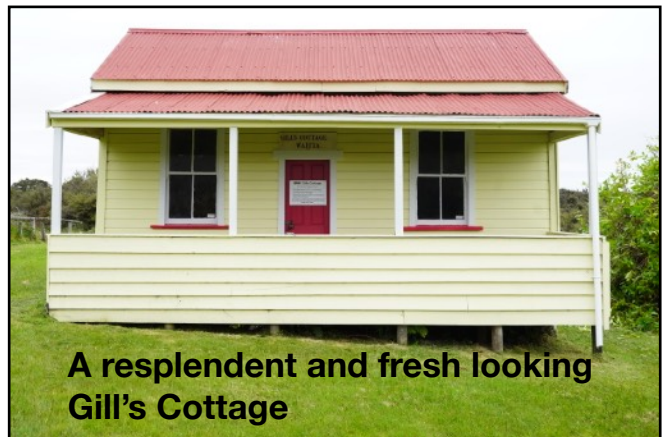
A resplendent and fresh looking Gill's Cottage

We had a muster of five reporting for work. As is usual we had to work around the weather but we are used to this and have long incorporated flexibility into our work schedule. The forecast gave Thursday as being our best dry day and so it was with energy that we attacked Gill's Cottage for the painting of doors, sills and window surrounds. It was with satisfaction that we achieved this as the weather soon after made painting impossible. The building, externally, now looks 'finished' and credit to all